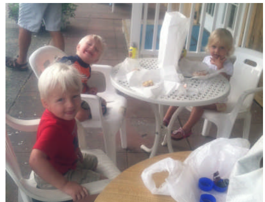
Enjoying a little donut time. M-M-M Good!